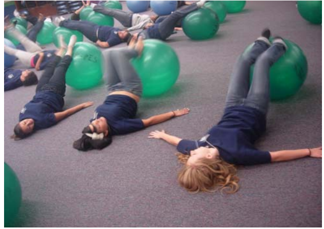
Enjoying the exercise balls