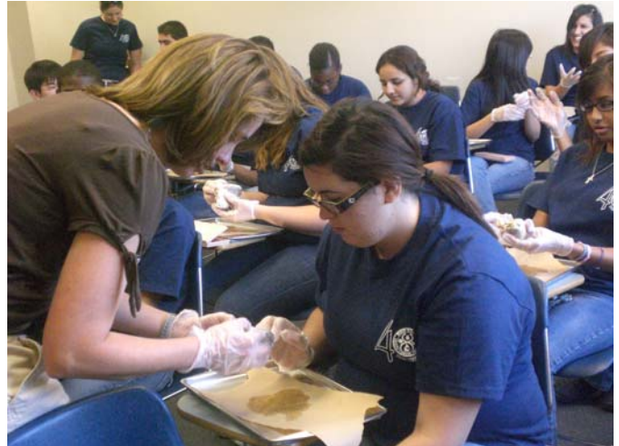
NAU trip heart dissection