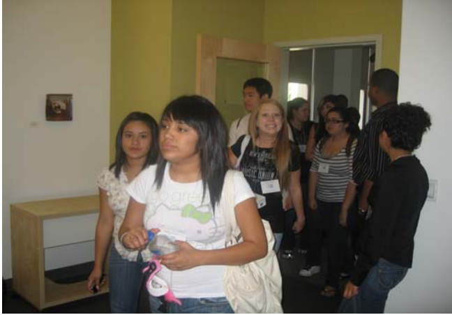
Leaving a successful day of class