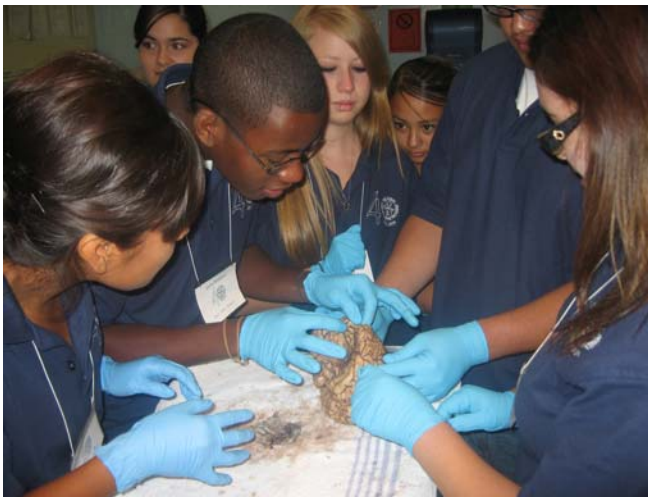
Banner tour examining the brain