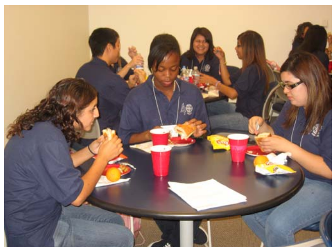
First day lunch social