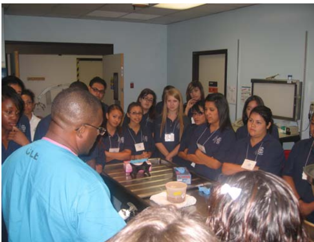
Morgue bone saw demonstration